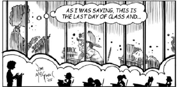
© 2005 SIBZ created by Jim and Pat McGreal