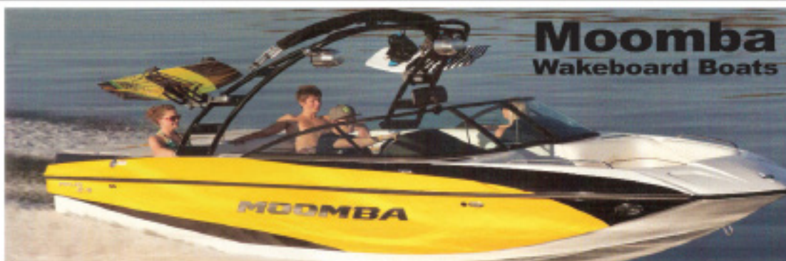
Moomba Wakeboard Boats