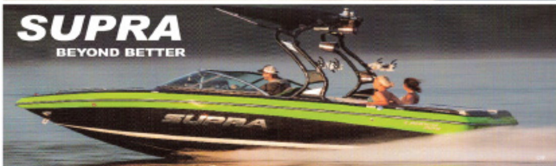
SUPRA BEYOND BETTER